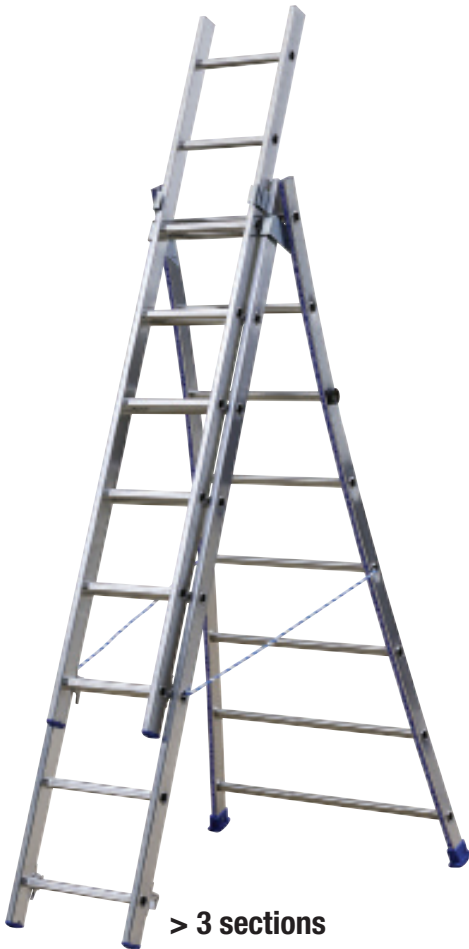
> 3 sections