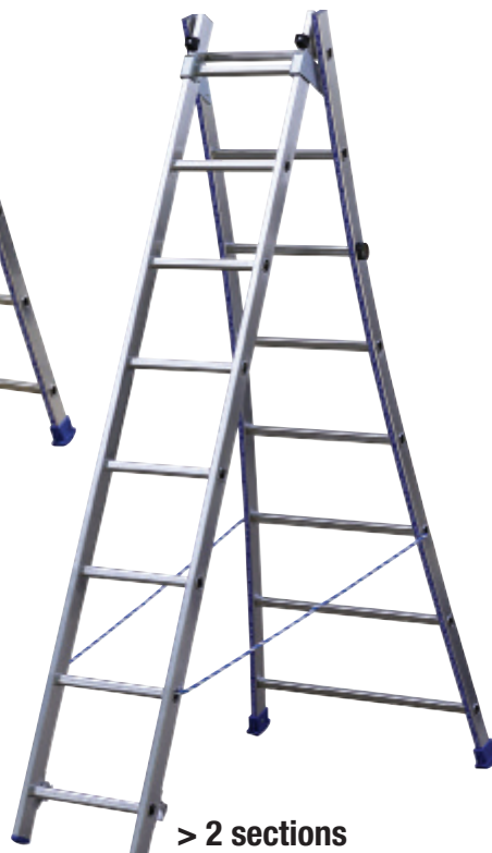
> 2 sections